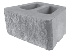
#818 - RockFace Unit

Before specifying a specific product, please confirm availability with your local Keystone Hardscapes producer.